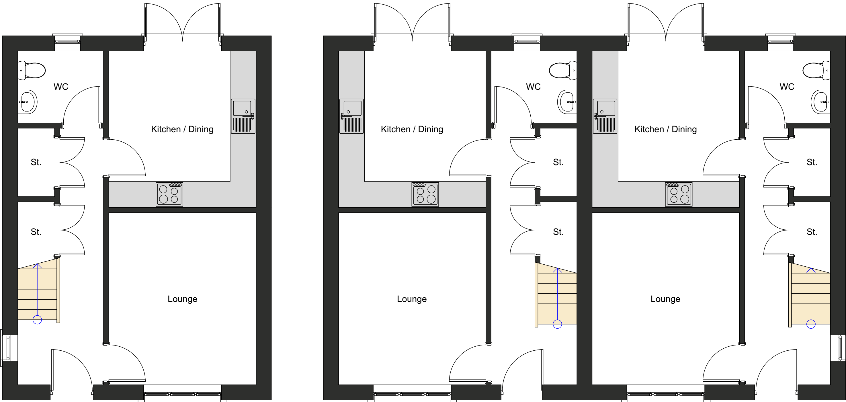
Ground Floor Plan 1:50